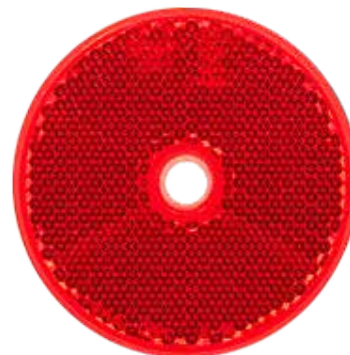
66R - Twin Blister