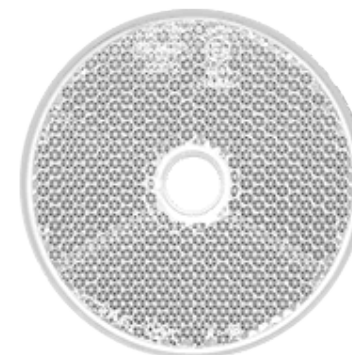
66W - Twin Blister